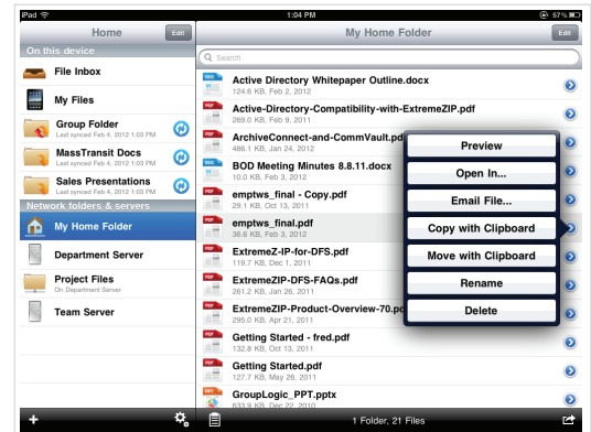
mobilEcho client app is simple for the end user.